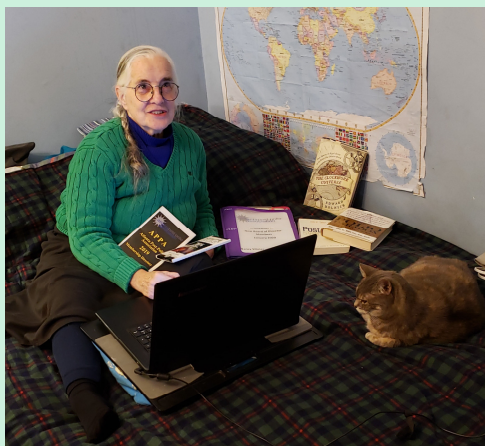
My day place and the APPA News Office