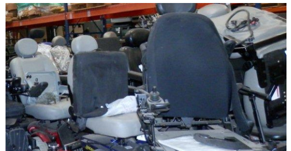
Special Needs Assistance Fund (SNAF) Pages 23-26