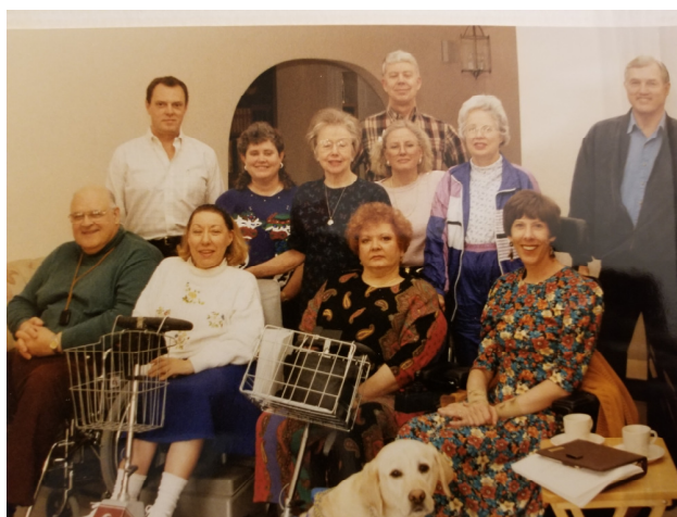
APPA History quiz: identify the people in this picture. Answers on Page 16.