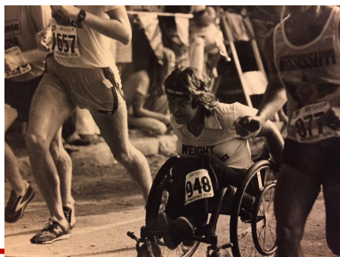
History of APPA, Pages 6-11

Dear Engineers & Techies. I would like a flying carpet so I can relax back muscles, adjust it to comfortable positions, and hover close to friends. In this age of flying out of the solar system, surely you all can come up with a flying carpet. "Other things to think about" Page 20